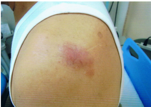
Figure 1. Tumor findings in the left shoulder. The tumor measured approximately 5 cm x 3 cm in size, was elastic soft, and had irregular margins, and there was no mobility or tenderness. Capillary dilatation was observed.

sive, and median survival time even in the early stage clinically is 12-14 months. While 80%-90% respond to initial chemotherapy, almost all of the cases relapse and acquire resistance to treatment. Reports of long-term survival have been seen when chemotherapy for acute leukemia and allogeneic hematopoietic stem cell transplantation have been performed to treat young patients.