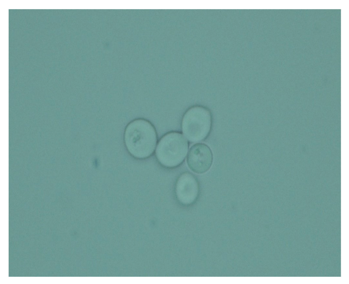
Figure 2. S. cerevisiae multipolar budding (observed in well 6).

with hyphae and pseudohyphae observed in well 6 must be accurately recognized [4].