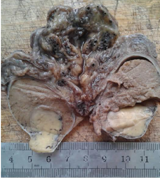
Figure 1. Macroscopic features of primary neuroendocrine tumor of the testes. The well-defined tumor shows a yellowish cut surface and has infiltrated the tunica albuginea.