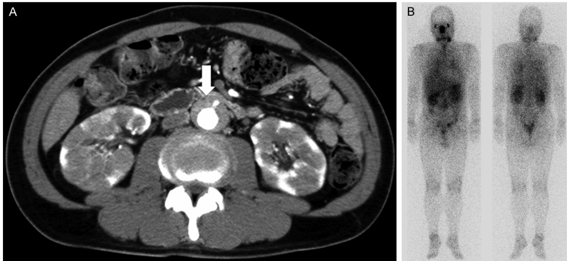
Figure 1. Detection of (A) renal lesions and periaortitis by computed tomography (CT) and (B) gallium-67 (Ga) accumulation on the submandibular gland, bilateral renal, and around the aorta by Ga scintigraphy.

phocyte level of 2058/ \mu L, an eosinophil level of 460/ \mu L, a hemoglobin level of 13.6 g/dL, a platelet count of 27.4 \times 10^4 / \mu L, a C-reactive protein level of 0.7 mg/dL (normal, <0.2 mg/dL), a total protein level of 9.2 g/dL (normal, 6.5-8.5 g/dL), an albumin level of 3.4 g/dL (normal, 4.0-5.2 g/dL), an aspartate aminotransferase (AST) level of 26 IU/L (normal, 5-37 IU/L), an alanine aminotransferase (ALT) level of 36 IU/L (normal, 6-43 IU/L), a lactate dehydrogenase (LDH) level of 174 IU/L (normal, 119-221 IU/L), a gamma glutamyl transpeptidase ( \gamma -GTP) level of 21 IU/L (normal, 0-75 IU/L), a total bilirubin level of 0.37 mg/dL (normal, 0.4-1.2 mg/dL), a direct bilirubin level of <0.05 mg/dL (normal, 0.1-0.3 mg/dL), an Amy level of 57 IU/L (normal, 43-124 IU/L), a Lip level of 12 IU/L (normal, 14-56 IU/L), a carbohydrate antigen 19-9 level of 23 U/mL (normal, 0-37 U/mL), a Span-1 antigen level of 11 U/mL (normal, 0-30 U/mL), a soluble interleukin-2 receptor level of 1260 U/mL (normal, 145-519 U/mL), a KL-6 level of 288 U/mL (normal, 0-499 U/mL), a CH50 level of 50.9 IU/mL (normal, 25-54 IU/mL), a C3 level of 113 mg/dL (normal, 69-128 mg/dL), a C4 level of 27 mg/dL (normal, 14-36 mg/dL), a C1q level of 1.5 \mu g/mL (normal, 0-3 \mu g/mL), an IgG level of 3728 mg/dL (normal, 870-1700 mg/dL), an IgG4 level >1500 mg/dL (normal, 4.8-105 mg/dL), and an IgG4/IgG percentage of 40.2%.