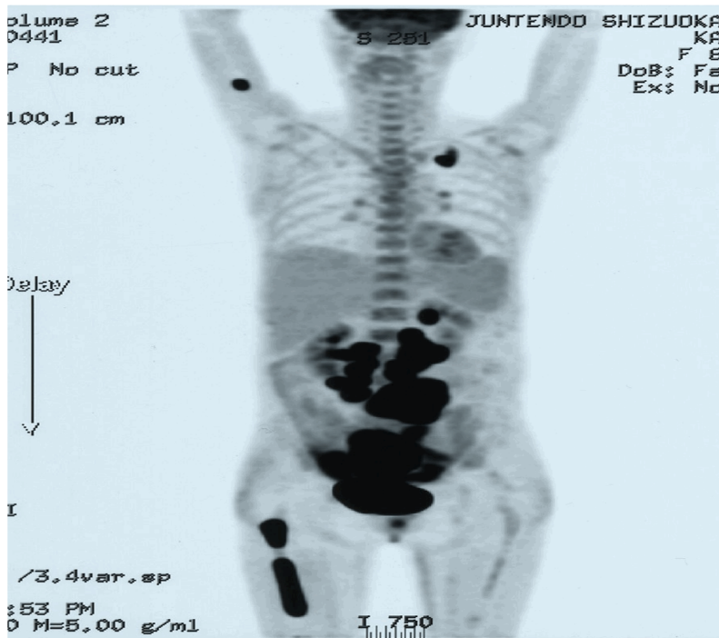
Figure 2. Abnormal sights were detected at right the upper arm and light sub-clavical and the duodenal and jejuna by pet computed tomography (CT).

an aggressive B-cell lymphoma occurring in the oral cavity arising with HIV infection. However,