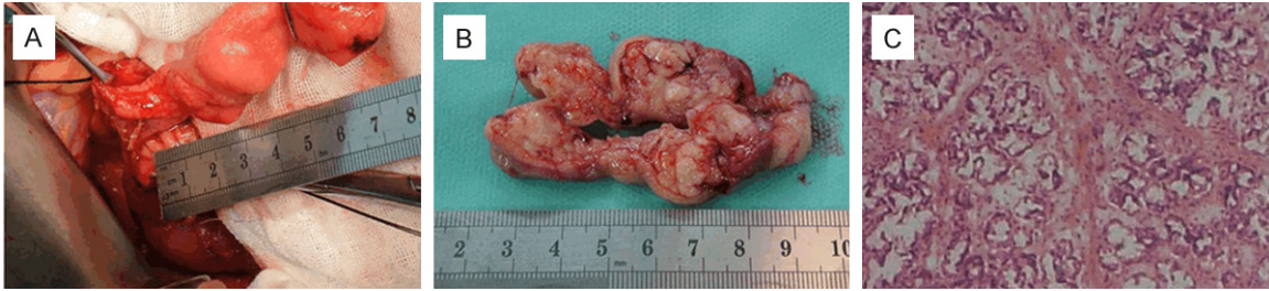
Figure 2. A. A photograph of operation field demonstrate a lesion in duodenum, measuring it's length approximately 7 cm. B. The gross surgical specimen showed a large duodenal lesion measuring 7.3×3.4×2.9 cm. C. Pathological examination revealed packed Brunner's glands and ducts admixed with smooth muscle.